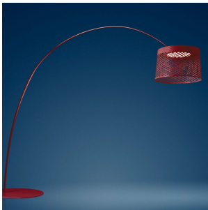
Twice as Twiggy Grid