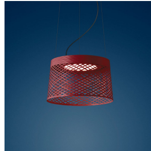
Twice as Twiggy Grid